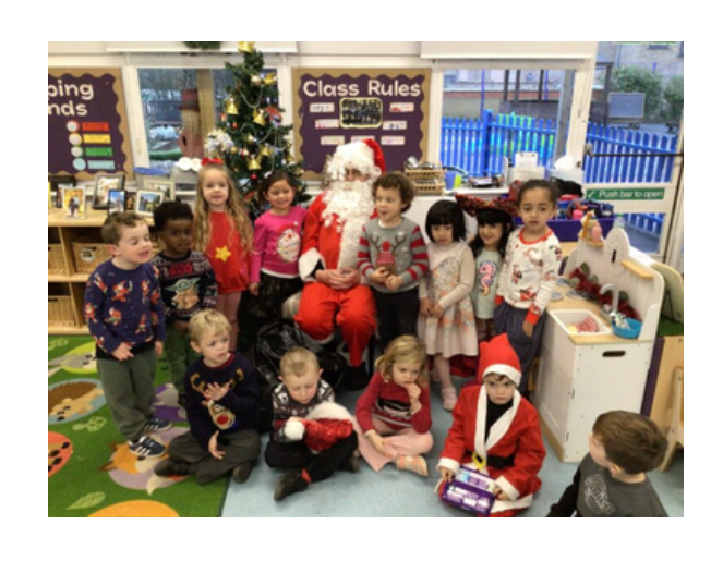
Carols at Vesta Lodge