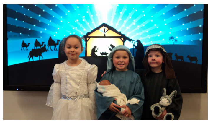
Key Stage 2 Carol Service