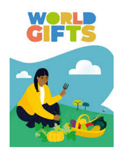
https://parish.rcdow. org.uk/stalbanssouth /newsletter/

All the classes have been busy fundraising for their class world gift from CAFOD. There is still time to bring in the coloured bauble the children were asked to decorate and make a donation. They will then vote on what they would like to 'buy' as a gift for a family in need overseas.